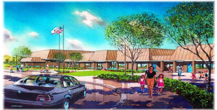
Ethel Allen School

Due to the recent slow down in the housing market and unusually high foreclosure rates in the area, the Board has decided to hold off on the construction of the Ethel Allen School. This project recently