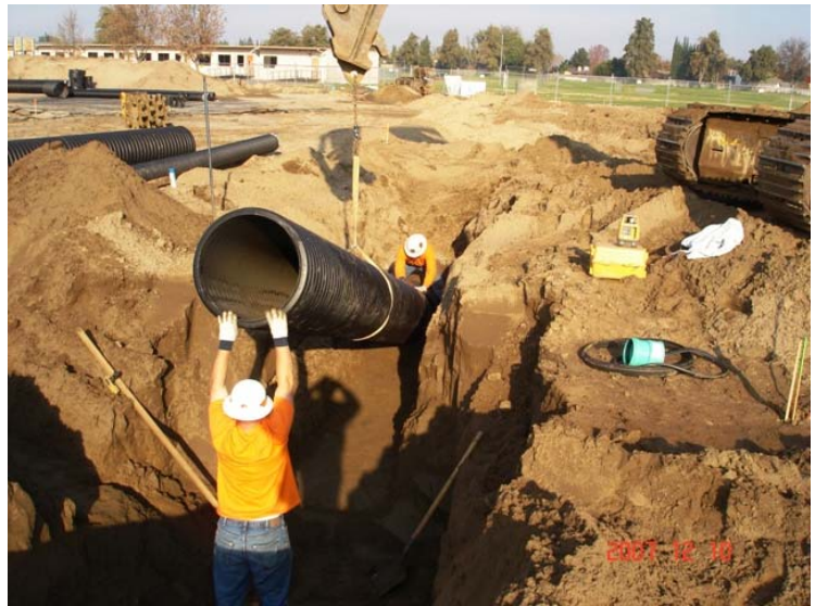
The New Neil Hafley Multi-Use Room is Underway

"These facilities are expected to be completed by November 2008."