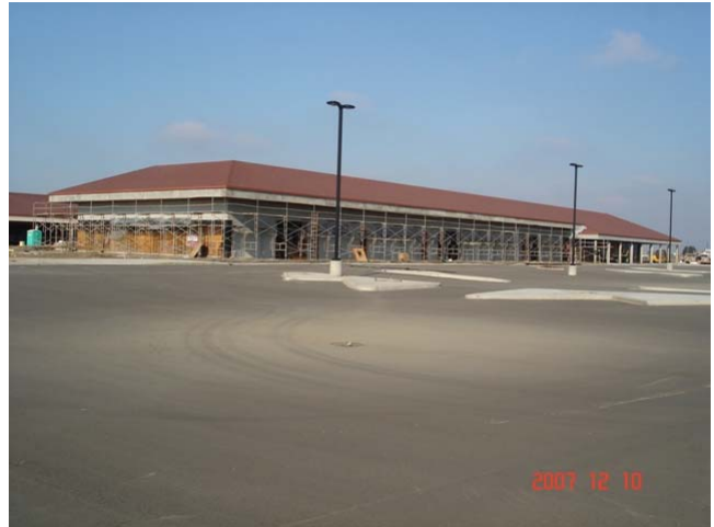
Classroom Wing at Lathrop High

This new high school through lease/lease construction methods has saved about $5 million